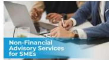
Non-Financial Advisory Services