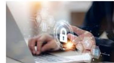
SME Awareness Vault

Please click here for Information regarding NFAS by Askari Bank