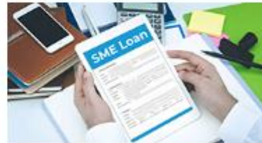
Apply for SME Loan